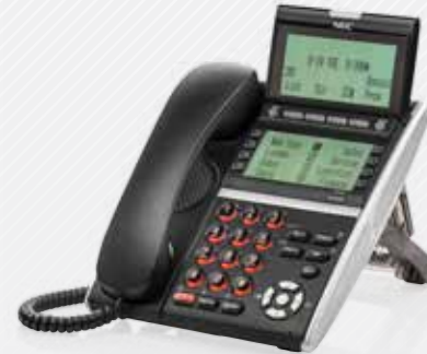
DT430 & DT830 Dual Display (Desi-less)