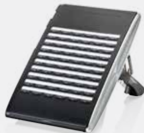
60-line DSS Console