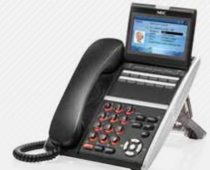
DT830CG Color Display