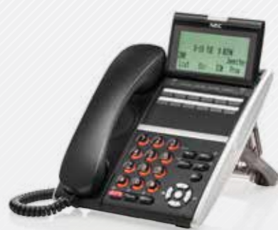
DT430 & DT830